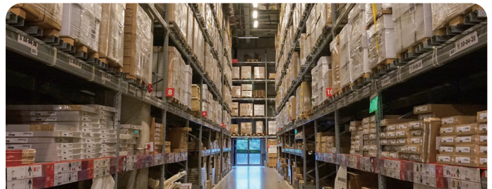
Manufacturing | Assets/Warehousing/Tools