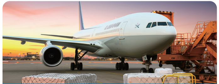
Public Utilities | Aviation/Medical/Finance/Electricity