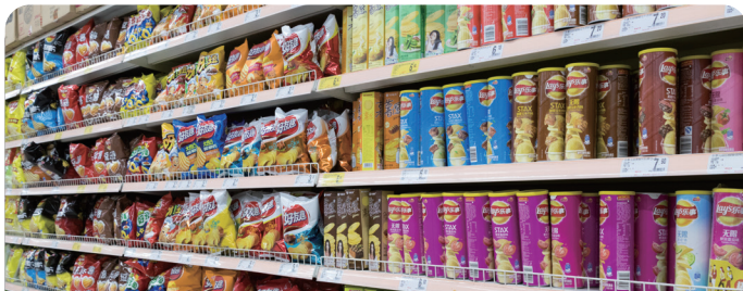
Retail | Retail/Store Management/Warehouse Management