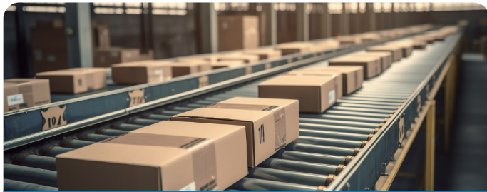
Logistics | Eco-friendly bags/warehousing/points